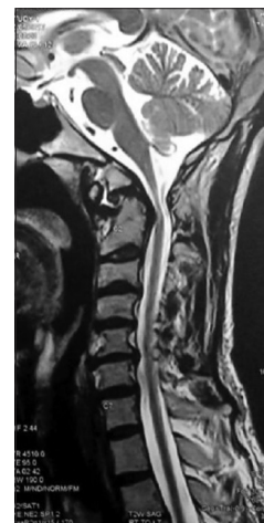
Figure 4: Sagittal T2-weighted magnetic resonance imaging scan showing cervical cord compression secondary to Os odontoideum