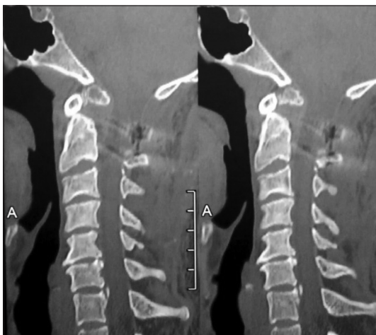
Figure 7: Postoperative computed tomographic scan suggestive of adequate stabilization and reduction of atlanto dens interval along with the maintenance of clivus canal angle

and Skoulikaris [3] they described the MR appearance of the odontoid process and calculated the prevalence of its