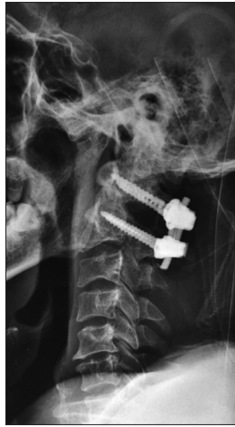
Figure 5: Postoperative plain roentgenogram demonstrating atlanto-axial stabilization and restored atlanto dens interval