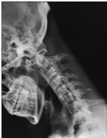
Figure 1: Increased atlanto dens interval

margins representing the remnants of odontoid process. Fielding et al [2] have classified it into two types based on anatomic location: Orthotopic and dystopic. It is usually found on in asymptomatic individuals with an estimated prevalence of 0.7%, [3] but fulminant myelopathy is also described secondary to minor trauma. The TAL functions by restraining atlantoaxial motion. In OO, there is failure of this ligament secondary to the loss of bony support by the odontoid process. This becomes important as the person then suffers from mobile or insufficient dens, and it may cause translation of the atlas on the axis and may compress the cervical cord or vertebral arteries. [4] The exact etiology still remains obscure because those malformations mostly are incidentally detected in asymptomatic patients or are diagnosed only when patients become symptomatic. There are several reports of patients with OO becoming quadriparetic after minor trauma. [5] Although OO is a rare condition, its exact frequency remains unknown since no large-scale screening studies have been performed. Nevertheless, in a study made by Perdikakis