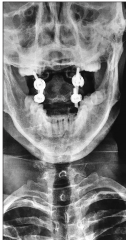
Figure 6: Postoperative anteroposterior roentgenogram demonstrating atlanto-axial stabilization