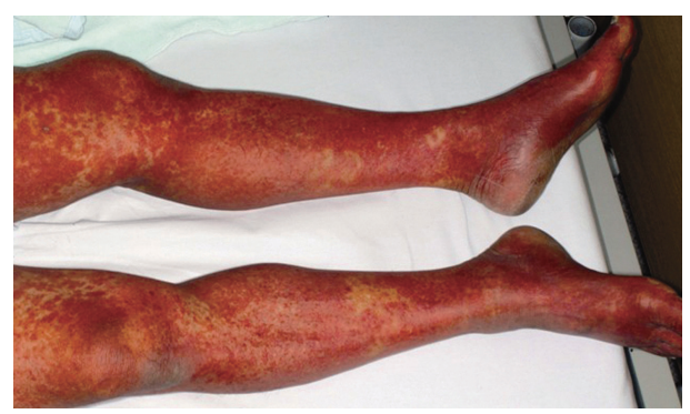
Fig. 1. Generalized maculopapular skin eruption with exfoliation is observed.

A 54-year-old Korean man presented with jaundice that had developed 1 week earlier. He did not have any medical illnesses. On presentation, his body temperature was 39.2°C, resting heart rate was 90 beats per minute, respiratory rate was 16 breaths per minute, and blood pressure was 125/80 mm Hg. Physical examination revealed a generalized erythematous maculopapular rash, which gradually became