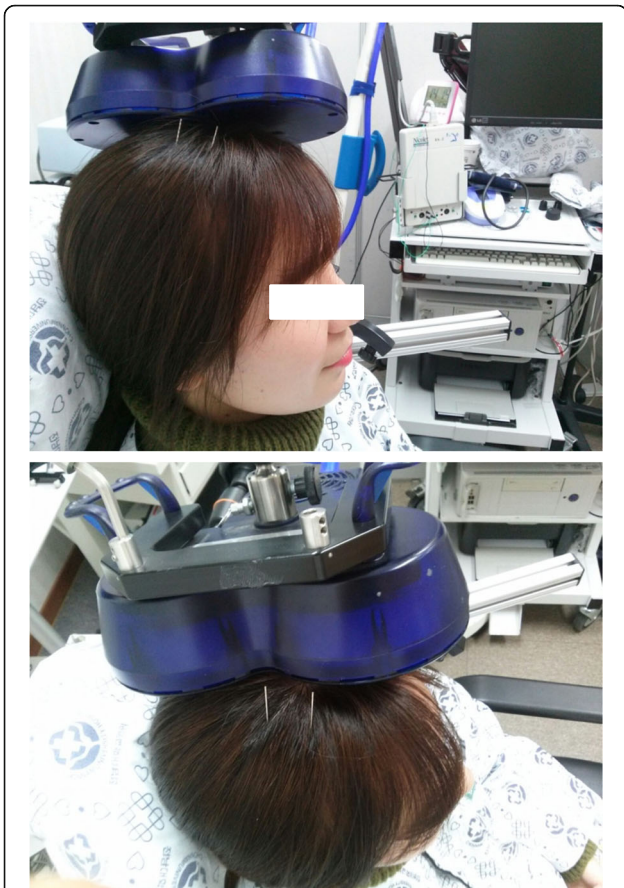
Fig. 2 Application of SAEM-SC. LF-rTMS over the M1 region hot spot (motor cortex at the left hemisphere) and SA stimulation of MS6 and MS7 at the upper limb regions of the right hemisphere

The MBI is an assessment tool used to objectively evaluate performance of everyday movements on 10