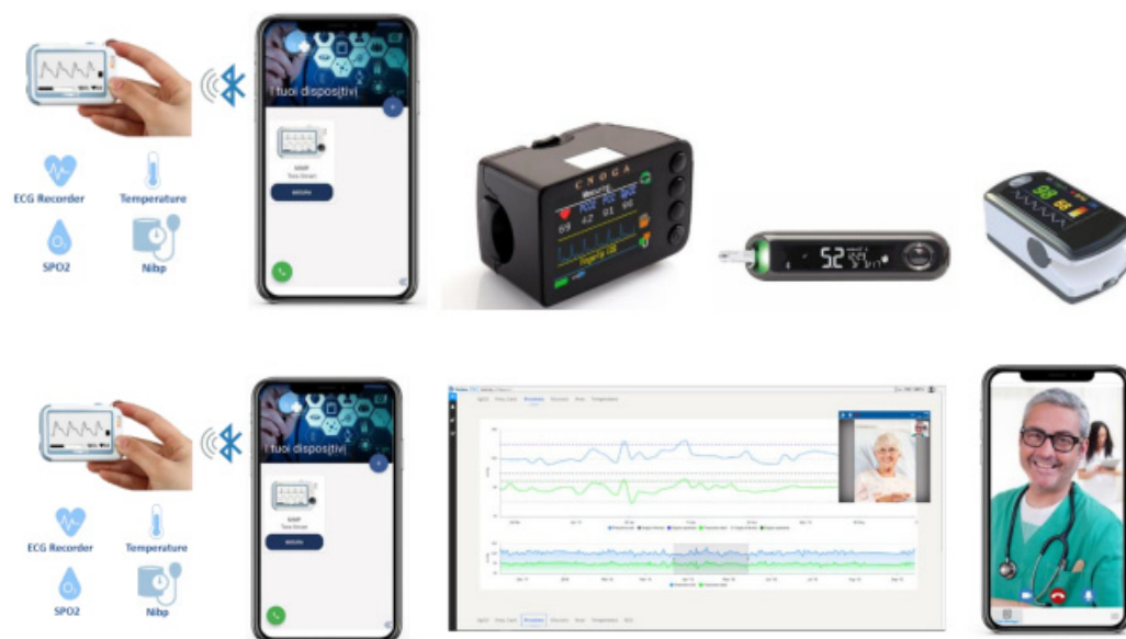
Figure 1. Tools used for telemedicine service.

Each patient who chose to enroll in this service was referred by Provincial Health Care Providers (ASP). For each enrollment, operators went directly to the users’ homes and delivered a tablet equipped with all the accessories for monitoring. During the delivery was made a brief training for the proper use of the platform.