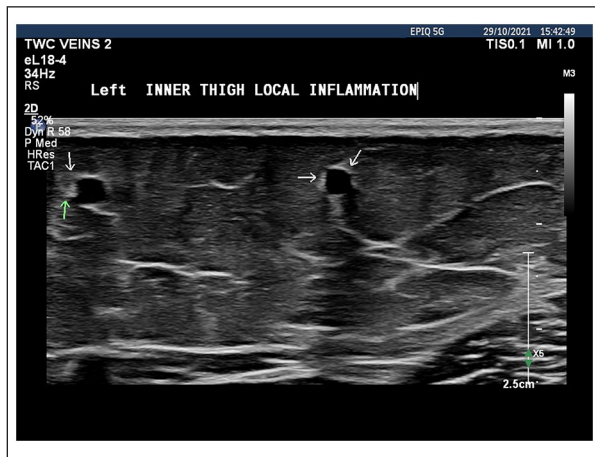
Figure 1. Ultrasound showing two superficial veins in the transverse section in the left thigh's sub-cutaneous fat, with perivenous inflammation (arrows).