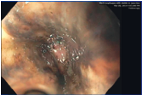
FIGURE 2: Circumferential black discoloration of the distal esophageal mucosa with clear demarcation with the uninjured GE junction.

(PPI), antibiotics, and fluid hydration; apixaban was held. The rest of his hospitalization was unremarkable, and he was discharged to a long-term care facility. We intend to perform repeat endoscopy to confirm resolution of mucosal injury and rule out stricture formation.