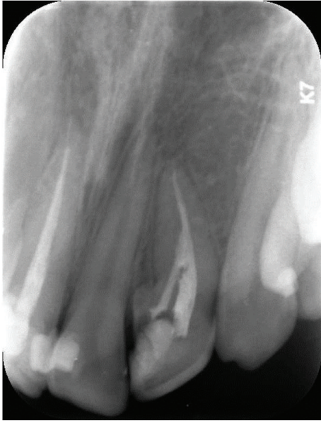
FIGURE 4: Recall radiograph after 6 months.

a restorative treatment. The teeth were restored with a nanofilled resin composite (CLEARFIL MAJESTY Esthetic, Kuraray Medical Inc., Japan). Six months later, the tooth was asymptomatic and all clinical findings were within normal limits (Figure 4).