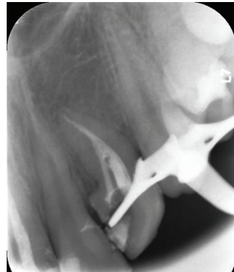
FIGURE 3: Obturation of root canals.

the pulp tissue was exposed. The patient was anesthetised, and rubber dam was placed and stabilised using widgets. The main canal and invaginated canal communicated at the middle of the root. The working length was established by a Raypex 5 apex locator (VDW Endodontic Synergy, Munich, Germany). A radiograph showed the fusion of the main canal and invagination (Figure 2). The root canals were prepared with stainless steel H files (Mani Inc., Tochigi, Japan) using