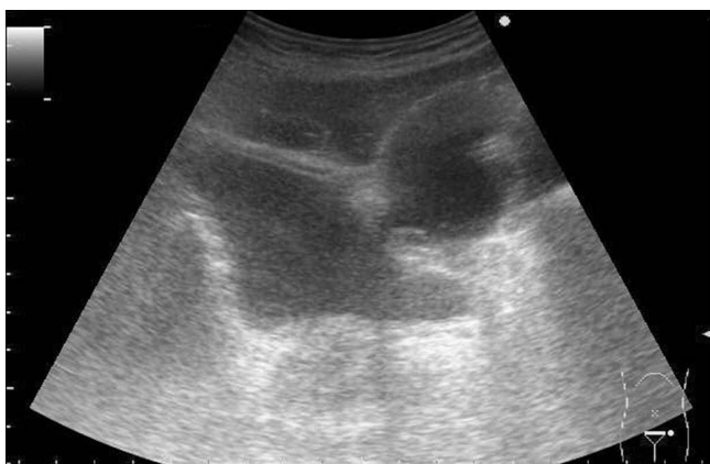
Figure 1 Transverse transabdominal grayscale sonogram of the pelvis showing a large bladder diverticulum.

The long-term stay of the catheter may cause a damage of the uroepithelial layer not only of the urethra but also of the opposite bladder wall (the one located opposite to the tip of the catheter). This problem may relatively more often occur in diabetic patients without any symptoms and may reveal itself in a later period. In our patient the chronological examination of the clinical data showed a causal relationship between the catheterization and the appearance of the diverticulum. This is a rare late complication of the urethral catheterization, which necessitates an ultrasonographic examination of the lower urinary tract after the complete catheter removal. A thorough examination of the clinical indications for Foley catheter placement and its timely removal should be conducted.