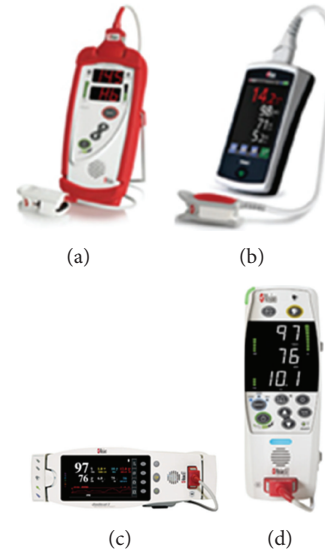
FIGURE 1: Handheld spot check devices, (a) Pronto; (b) Pronto-7, and continuous monitoring bedside devices, (c) Radical-7 and, (d) Rad-87.

There have also been a few studies published in Emergency Room patients. Sjostrand et al. investigated the accuracy of SpHb using repetitive controls of venous blood samples from 30 patients in a tertiary care emergency room [13]. A total of 242 comparative data pairs were obtained, resulting in a mean deviation of -0.47 g/dL (CI -0.39 to -0.09 ) for SpHb. After exclusion of 5 patients due to low signal quality, the deviation decreased to -0.24 g/dL (CI -0.39 to -0.09 ). Chung and colleagues [14] from Inje University Seoul Paik Hospital in Seoul, Korea, studied the accuracy of SpHb compared to laboratory measurements from 217 patients presenting to the emergency department. The correlation coefficient between laboratory haemoglobin and SpHb was 0.81 in all patients indication of good agreement between the two methods of measurement. In a prospective study on 300 emergency patients in France, Gayat et al. compared spot check SpHb to laboratory analysis of venous blood [15]. The absolute mean difference between SpHb and laboratory measurements was 0.56 g/L (confidence interval (CI) 0.41 to 0.69), with a correlation coefficient of 0.80 (CI 0.74 to 0.84). The accuracy of spot check SpHb was also investigated in the outpatient setting by Raikhel [16]. In a prospective observational study, the accuracy of SpHb measurements and capillary measurement of haemoglobin were compared to laboratory haematology analyser measurements from venous