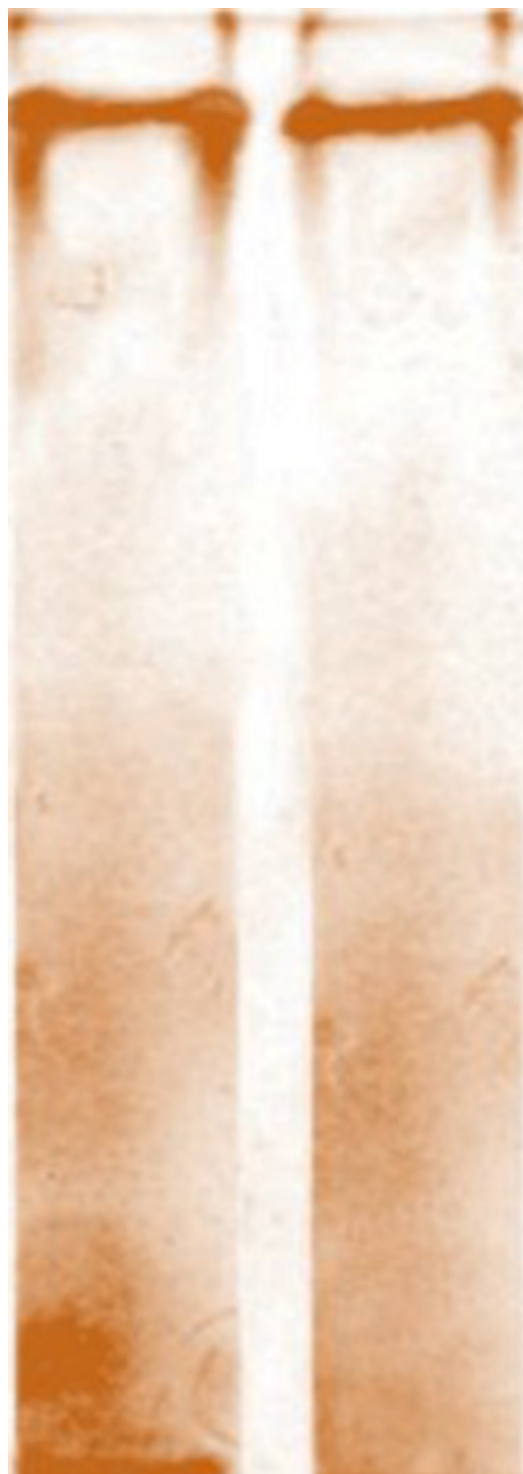
Lane 1: 10 \mu\text{g} of LPS, lane 2: 5 \mu\text{g} of LPS.