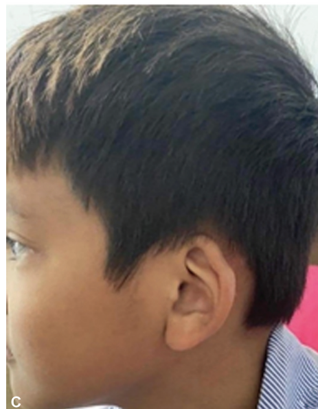
Fig. 6 Preoperative (A), immediate postoperative (B), and 4-year postoperative (C) views of a patient.