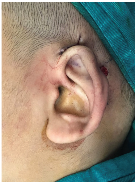
Fig. 5 After suturing the incision. The scar was located in the retroauricular region so it is less visible.