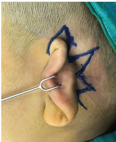
Fig. 2 Skin incision design.