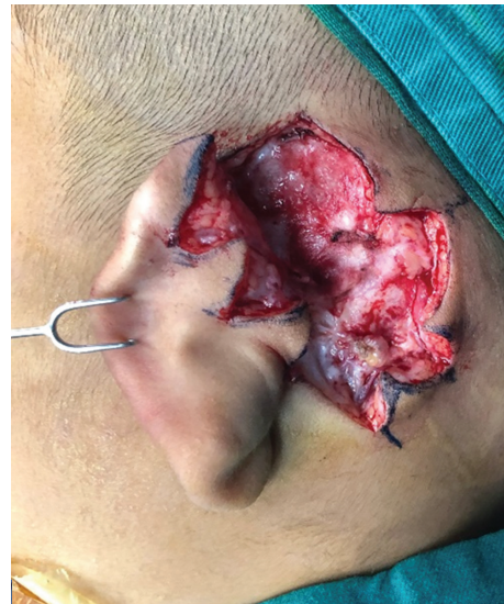
Fig. 3 Surgical skin incision of triangular flaps. Abnormal intrinsic auricular muscles were removed.