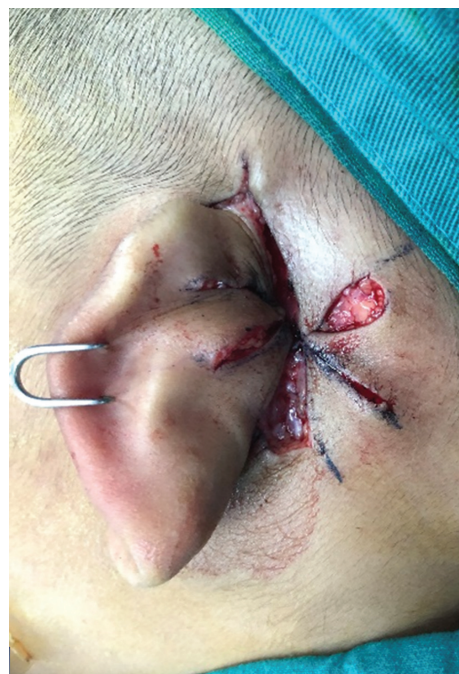
Fig. 4 The flaps were sutured together to a discrete central focal point. The subcutaneous tissues were sutured to the cartilage to form the auriculocephalic sulcus.

The authors have received written consent from the patient's parents for permission to use the images.