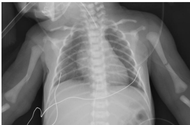
Fig. 1. On infantogram fractures on both humeri were observed.

Subsequently, he was transferred to Pusan National University Yangsan Hospital and was placed on ventilator support. His