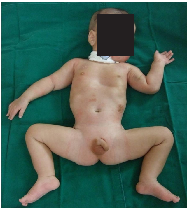
Fig. 2. The patient manifesting a frog-like posture, long face, and undescended testes.

birth weight (2,930 g, 50th percentile), length (51 cm, 75th to 90th percentile), and head circumference (35 cm, 90th percentile) were within the normal range. He had no abnormalities based on the chest radiograph, but findings showed fractures on both his humerus which were splinted for treatment within one month (Fig. 1).