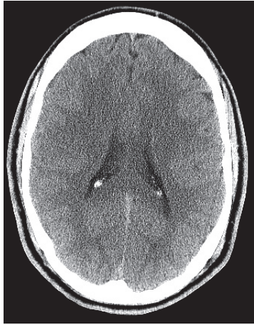
FIGURE 1: CT of the brain without contrast shows no intracranial abnormalities.