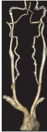
FIGURE 2: CT angiogram reconstruction of the neck shows no obstruction, dissection, stenosis, or abnormalities.

(Figure 1) and CT angiogram (CTA) of the neck (Figure 2) were normal as read by an experienced neuroradiologist. His echocardiogram was also normal. He was diagnosed with a concussion and possible cervical radiculopathy and discharged with cyclobenzaprine, methylprednisolone, and analgesics.