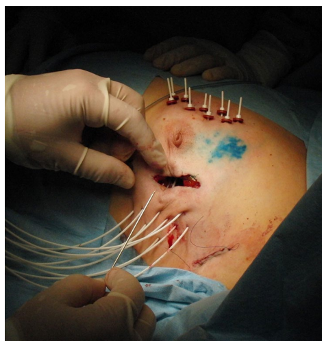
Figure 4 Perioperative open-cavity multi-catheter interstitial implantation. University Hospital in Hradec Kralove, Czech Republic.

It is also possible to use the implant for the interstitial cavity boost, with consequent WBI.