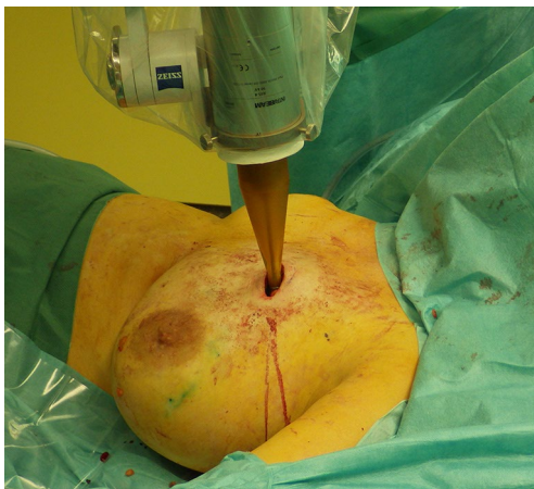
Figure 1 Intrabeam applicator being placed in the tumour bed.

Society (ABS), have provided recommendations aimed at patient selection for APBI (5-7). Detailed guidelines concerning the appropriate target definition and quality assurance are also available, especially for MIB APBI technique (25,26). Likewise, long-term outcomes are well documented for MIB (21,22), but less so for other APBI techniques. Finally, the long-term risk of secondary cancer is reduced 2- to 4-fold in MIB with the lowest mean lung dose, compared to other APBI techniques (27).