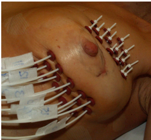
Figure 3 Accelerated partial breast irradiation (APBI): multi-catheter interstitial brachytherapy (MIB). University Hospital in Hradec Kralove, Czech Republic.

after APBI, compared with baseline values (28).