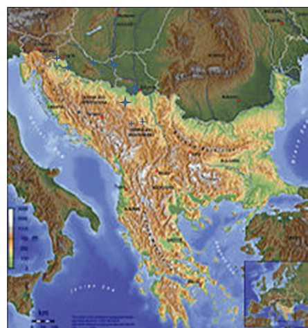
Figure 3: Investigated areas around Balkan countries (small blue stars: BiH – Republika Srpska, FYROM) and headquarters spots - Serbia

The survey presented 84 herbal original prescriptions, including overall 61 plant taxa from 27 families, which are listed by alphabetical order, including local name and synonyms, as well as preparation mode and usage. Some of them were reported for use concerning two or more oral ailments/diseases (for an example toothache and gum bleeding). The most frequently used plants belong to family Compositae (10), Lamiaceae (9), Rosaceae (7), Leguminosae (4), Amaryllidaceae (3), and Amaranthaceae (3), like all others they were presented with two or one species. The first three families cover 42.6% from established plants. Half of the plants is cultivated (C), 39.6% from wild localities (W), and 10.3% may be collected whether as wild or cultivated (W/C). This study did not identify the folk names that directly show the use of plants in the care of teeth.