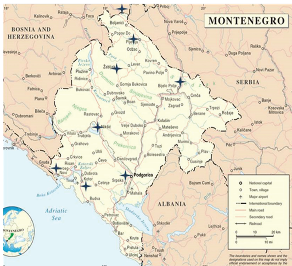
Figure 2: Inquired places (black crosses) in Montenegro (coastal and landlocked areas)

Upon deep and patient analysis of herbal names (synonyms) obtained from various regions, the list of corresponding botanical names was arranged, which were previously translated into English.