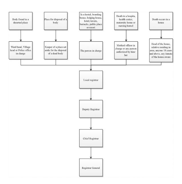
Figure 2. Process of death registration as described in births, deaths etc Compulsory Registration Act.

The process for death registration in Nigeria is provided for in the Birth and Deaths etc. (Compulsory Registration) Act of 1992 as modeled in Figure 2. The Act specifies persons responsible for reporting deaths and providing the required information at the point of registration. Deaths are to be reported to the local registrar of the locale where the incident occurred by the household head or a close family member if the death occurs at home, by a medical officer or any other authorized person if the death occurs in