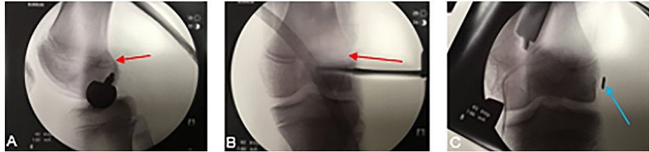
FIGURE 3: Lateral (A) and anterior-posterior (B, C) intraoperative fluoroscopic imaging used to confirm the accurate location of the femoral tunnel. The tunnel was placed as low and as posteriorly as possible, due to the open physis (red arrows). Suspensory fixation was utilized on the femur and is identified by the blue arrow (C).

as possible. Anterior-posterior and lateral fluoroscopic images were taken to confirm a tunnel location distal to the femoral epiphysis and can be seen in Figures 3A-3C. A retrograde, inside-out reamer was then used to create a tunnel 20 mm in depth and 7.5 mm in diameter. Regarding the tibial tunnel, a cannulated acorn reamer created a 9 mm tunnel with the tunnel aperture being slightly posterior to the posterior border of the anterior horn of the lateral meniscus. Suspensory fixation was used on the femoral aspect and a bio-composite interference screw (Arthrex, Naples, FL) was used on the tibial side. After final tightening, the Lachman exam had normalized. The reconstructed ACL and repaired lateral meniscus can be seen in Figures 4A, 4B.