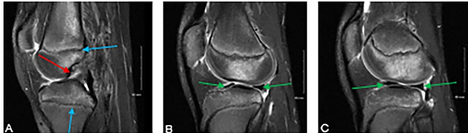
FIGURE 1: T-2 weighted MRI sequences of the left knee demonstrating an isolated ACL tear (A) (red arrow). Medial (B) and lateral (C) menisci appear to be intact (green arrows). The open physes are identified with blue arrows.

Two years later, the patient presented to the attending surgeon following repeated instability events. Repeat radiographs and MRI were obtained. Radiographs demonstrated an open physis. MRI indicated an ACL tear and intact menisci; the pertinent images can be seen in Figures 1A-1C. The physical examination consisted of a 2B Lachman, mild to moderate lateral joint line tenderness, and negative medial and lateral McMurray's. Based on the recurrent instability events and risk for continued intra-articular damage operative intervention was recommended. Continued nonoperative management was discussed but not recommended due to the demonstrated instability of the knee.