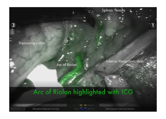
Fig.3 Indocyanine green Firefly fluorescence imaging on Da Vinci<sup>™</sup> to aid in visualisation of the AoR intraoperatively