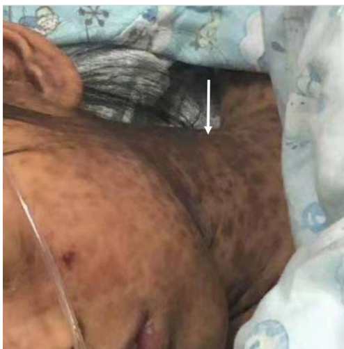
Figure 1 A small red rash appeared on the neck and then spread to the face and body. As shown by the white arrow, there is a large area of bullous erythema multiforme.

Stevens-Johnson syndrome (SJS) is a serious adverse skin reaction, but it is relatively rare, with an annual incidence of only 1–2/1,000,000, which is regarded as a medical emergency. NSAIDs are listed as high-risk drugs to induce SJS (3).