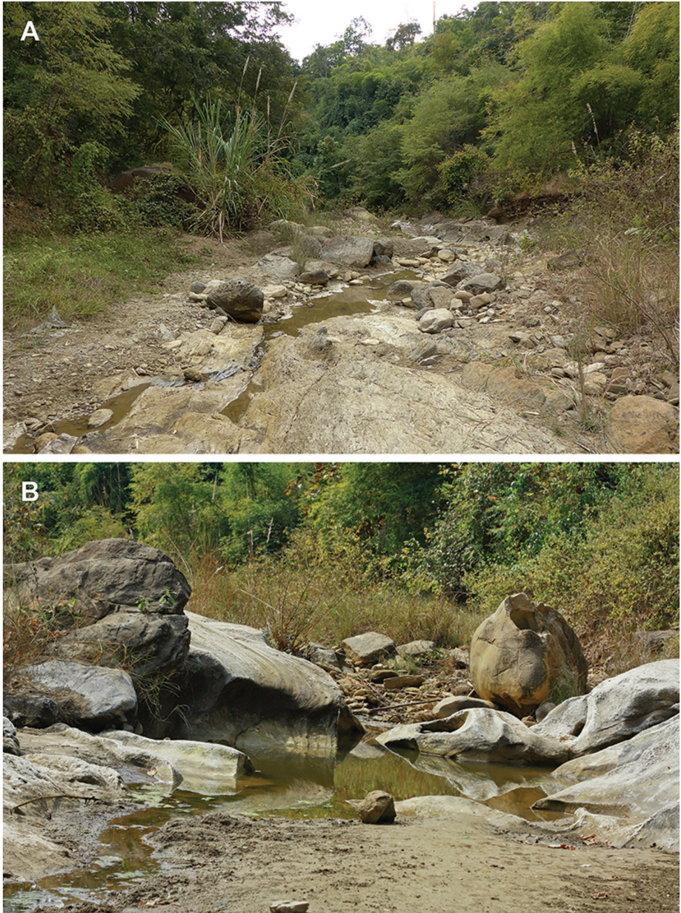
Figure 13. Type locality of Alloscorpiops viktoriae sp. n. in Magway region of Central Myanmar. A Overall view on natural habitat of the new species B Detail view on the same habitat. All specimens were found under stones located directly in humid riverbed.