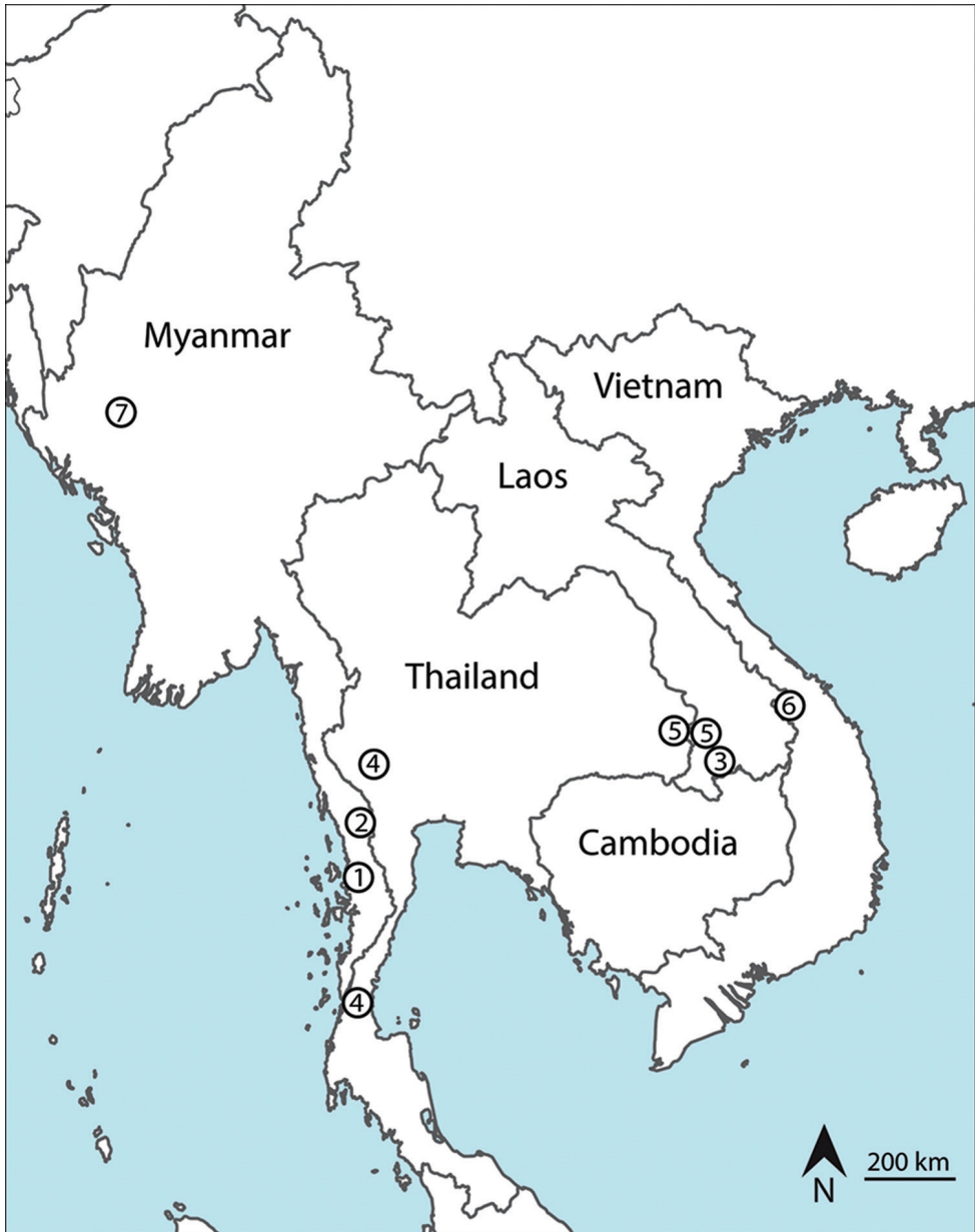
Figure 14. Map of southeast Asia showing the known distribution of the species belonging to the genus Alloscorpiops : Alloscorpiops anthracinus (1), Alloscorpiops lindstroemii (2), Alloscorpiops calmonti (3), Alloscorpiops citadelle (4), Alloscorpiops wongpromi (5), Alloscorpiops troglodytes (6) and Alloscorpiops viktoriae sp. n. (7).