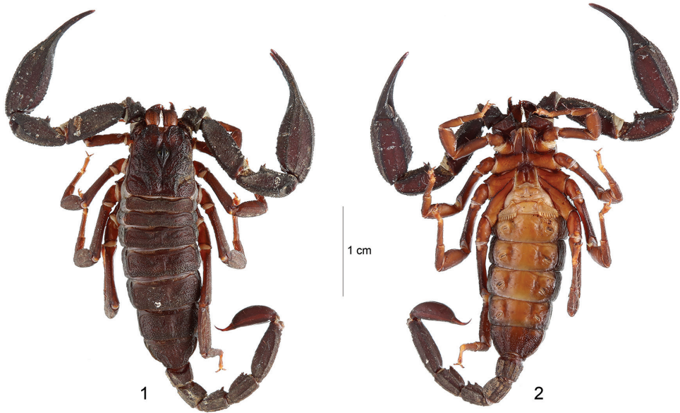
Figures 1–2. Alloscorpiops viktoriae sp. n. Female holotype. Habitus. Dorsal and ventral aspects.