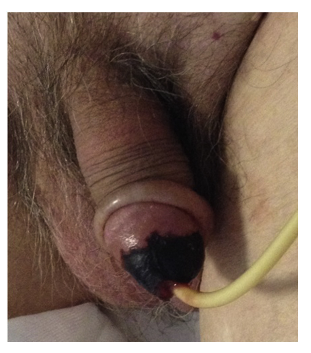
Fig. 1. Paraphimosis, the foreskin constricting the penis at the coronal sulcus. The distal glans is necrotic and the area is dry and well-demarcated.

E-mail address: franco.palmisano02@gmail.it (F. Palmisano).