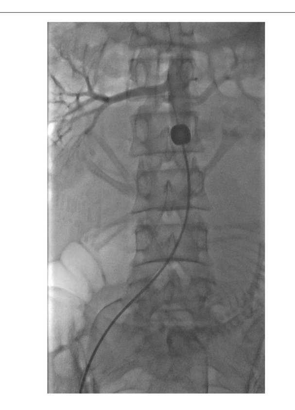
FIGURE 3 | Image of the balloon. The balloon was placed into the distal abdominal aorta beneath the opening of the renal arteries.

A new compliant 14 \text{ mm} \times 10 \text{ mm} Fogarty balloon catheter (Edwards Lifesciences, USA) was used. After confirming the good position of the balloon, cesarean section was performed, Figure 3.