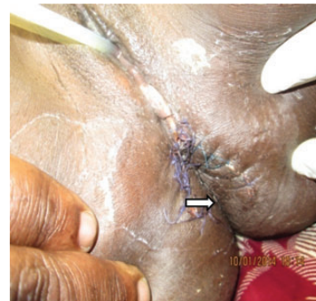
Figure 5: Wound closed in an inverted 'Y'-shaped manner with elongation of the skin over the perineal body (arrow-anal canal; deeply-seated anal verge with increase length of anal canal).

with interrupted sutures of 3-0 polygalactin to provide added support to the rectovaginal septum. An overlapping repair of ~3 cm of the mobilized edges of the external sphincter extended the length of the anal canal and was performed using five horizontal mattress sutures of 2-0 polygalactin (Fig. 4). Following irrigation and haemostasis the semi-circular skin wound which has now almost become longitudinal was closed in an inverted 'Y' fashion. The distance between the posterior forchette and the anal canal was seen to be lengthened (Fig. 5). Postoperatively, sitz baths were instituted and the patient was given a low-residue diet for the first 48 h. Apart from constipation relieved with microlax enema, she made