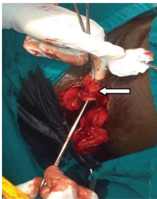
Figure 2: Vagina carefully separated from the anterior rectal wall (arrow); gauze swab in the right and left ischioanal fossa, respectively.

the anterior margin. The anodermal flap was carefully mobilized from the vagina by sharp dissection in a cephalad direction to expose the entire length of the injury with the plane lying posterior to any large paravaginal veins (Fig. 2). The edges of the damaged sphincter muscle were identified and the plane between the anal mucosa and the muscle on either side was developed. As the injury extended proximally into the levator ani (puborectalis) muscle, an anterior levatorplasty was performed by plicating the anterior limbs of the muscle to the midline with 2-0 polyglactin sutures (Fig. 3). This opposed the pelvic floor in the midline anteriorly and reconstructed the perineal body. The anterior defect of the IAS extended through the anal mucosa and was plicated with 2-0 polygalactin suture (Fig. 3). The vaginal wall was plicated