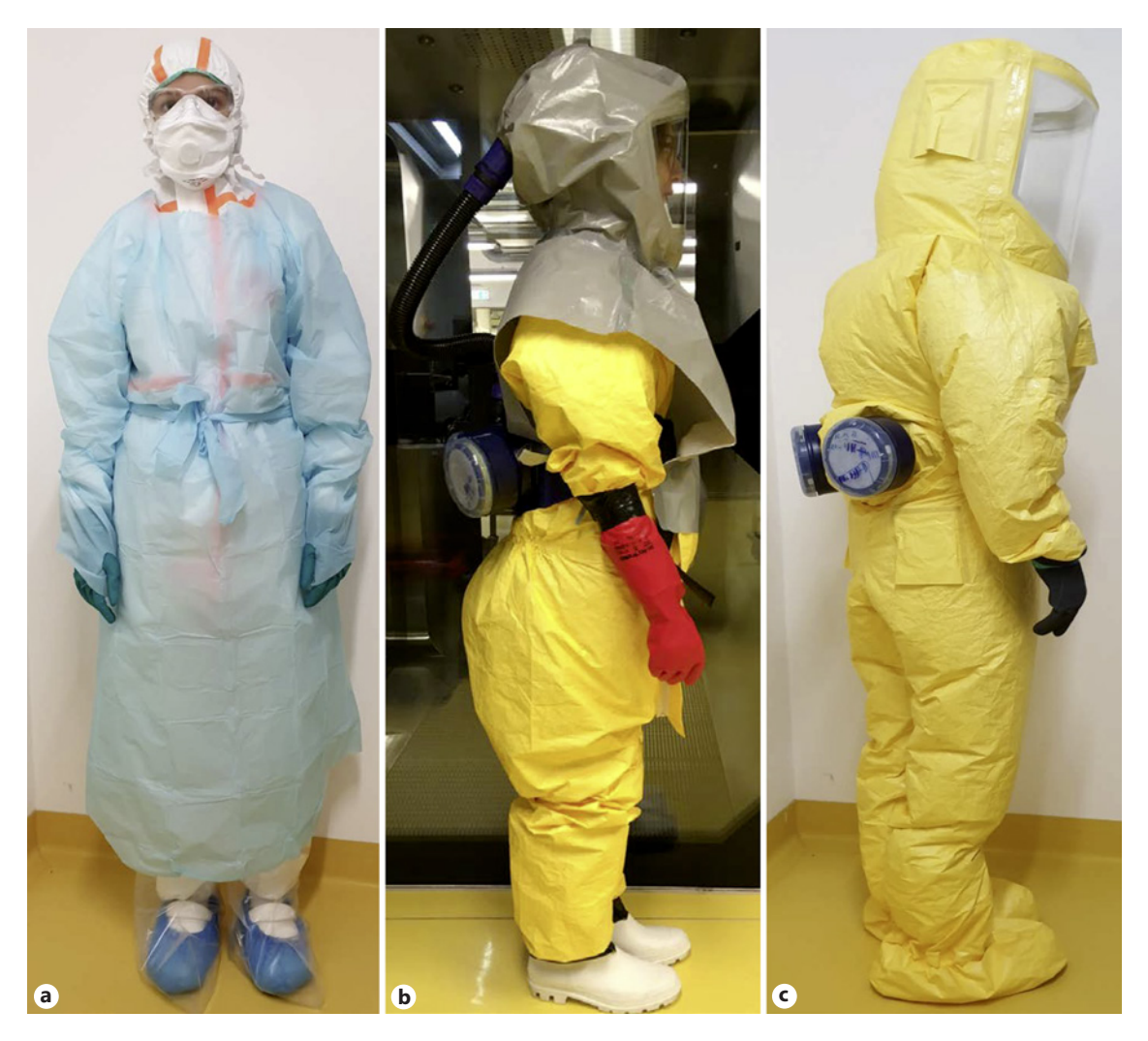
Fig. 3. Three different types of PPE. a PPE light. b PPE-heavy variant 1. c PPE-heavy variant 2.

water are provided locally at the autopsy table by peristaltic pumps. Waste water is collected in plastic containers for inactivation by autoclaving. Waste water pipes in the floor were avoided to facilitate decontamination. Our practical experience showed that the use of water can be avoided during most autopsies, and small amounts of ascites or pleural fluid can be easily removed using cellulose paper towels, which are collected in single-use and sealed waste containers. For biobanking of tissue samples, two -80 °C freezers (one freezer serves as backup) are available. The use of liquid nitrogen is avoided in the laboratory because of safety and maintenance issues.