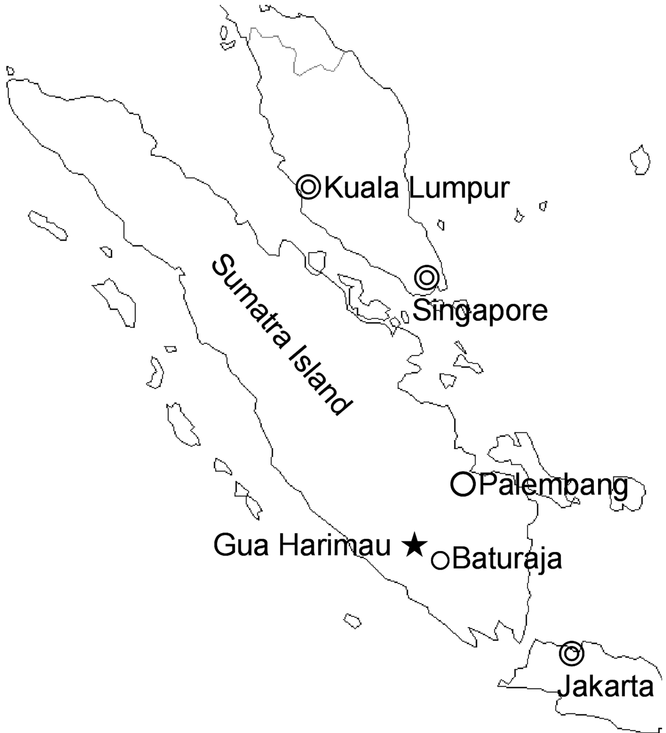
Fig 1. Location of Gua Harimau (star) in Southeast Sumatra, Indonesia.

https://doi.org/10.1371/journal.pone.0198689.g001