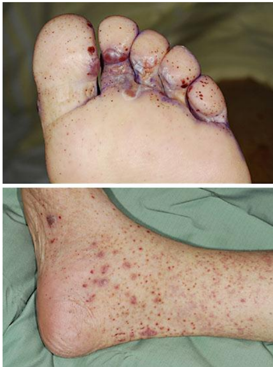
Fig. 1. Macroscopic lesions in leukocytoclastic vasculitis. Skin lesions of patient 2 after exposure to oxaliplatin in a FOLFOX regimen against metastatic colon cancer.