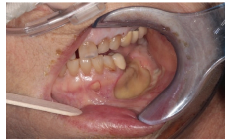
FIGURE 2: Intraoral photographs of necrotic, exposed bone surrounding site of extracted tooth #20.