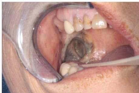
FIGURE 3: Intraoral photographs of soft tissue fistula in the right side of her soft palate.

gap metabolic acidosis and was managed with fluids, insulin, dextrose, and bicarbonate and took several days to stabilize. Blood cultures eventually grew out Escherichia coli which was sensitive to the antibiotics administered. A repeat CT scan showed no abscess but showed some air in the marrow on left side of the mandible (Figure 5(a)). It also showed air in the epidural space in cervical region (Figure 5(b)). Neurosurgery recommended treatment with antibiotics.