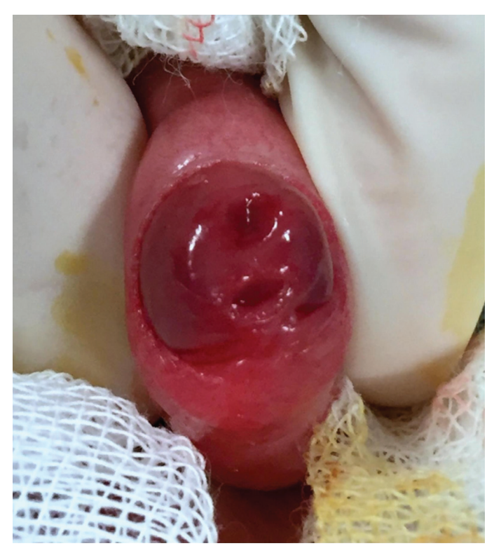
FIG. 2. Double urethral meatus on the glans.

to demonstrate the megalourethras (Figure 4a, 4b). Circular incision on the preputial mucosa and degloving were performed. After the ventral and dorsal megalourethras were opened, a 1-cm excision was made in the urethra for tapering of the dorsally placed megalourethra. After excision of the remaining tissues, the common wall of the proximally located normal urethras was repaired. The remaining distally placed urethra was tabularized with two-layer urethroplasty. Glansplasty and penile skin reconstruction were performed at the end of the procedure.