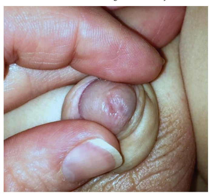
FIG. 5. Normal urethral external meatus of the patient in the visit one year postoperatively.

Several surgical techniques have been described to treat UD and megalourethra. Treatment of the UD with megalourethra should be individualized according to the anatomy.