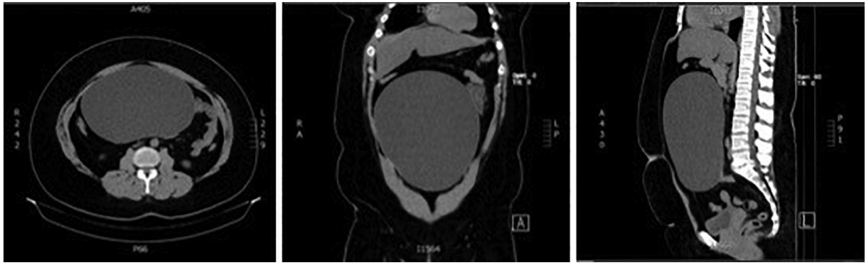
Fig. 1. CT scan showing a giant central cyst.

that the right ovary was visible and had a polycystic ovarian morphology and apparent presence of vascular flow. The left ovary had the same polycystic pattern.