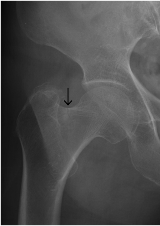
Fig. 1. Initial radiograph shows a right femoral neck fracture with sclerotic superior cortex and an undisplaced linear pattern.

9.0 (reference range: 8.4-10.5) mg/dL of serum calcium, a 4.0 (reference range: 2.5-4.5) mg/dL of phosphate, a 39 (reference range: 10-57) pg/mL of parathyroid hormone, and 72 (reference range: 30-120) IU/L of alkaline phosphatase along with a decrease at a 7.01 (reference range: 11-40) ng/mL of osteocalcin. In addition, C-telopeptide bone resorption marker was measured at 0.33 (reference range: 0.01-1.00) ng/mL of a normal finding. Based on the past medical history and other clinical findings, the patient was diagnosed as insufficiency fracture in the femoral neck which was thought to be resulted from the long-term use of bisphosphonate. Thus, multiple pin fixation was implemented (Fig. 2). The patient was postoperatively prohibited to take bisphosphonate and prescribed from taking calcium-vitamin D (calcium 600 mg + Vitamin D 400 IU) complex every day. She was allowed for partial weight bearing using a walking frame until the second postoperative month and for the entire weight bearing after the second postoperative month. In the 4th postoperative month of follow-up period,