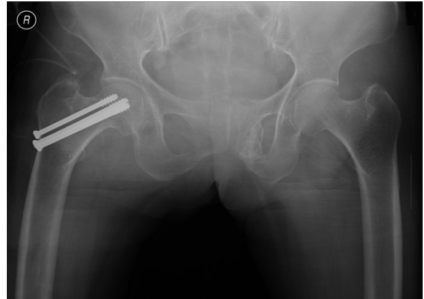
Fig. 2. Postoperative radiograph shows a well fixed 3 cannulated cancellous screws inside the femoral neck.

9.0 (reference range: 8.4-10.5) mg/dL of serum calcium, a 4.0 (reference range: 2.5-4.5) mg/dL of phosphate, a 39 (reference range: 10-57) pg/mL of parathyroid hormone, and 72 (reference range: 30-120) IU/L of alkaline phosphatase along with a decrease at a 7.01 (reference range: 11-40) ng/mL of osteocalcin. In addition, C-telopeptide bone resorption marker was measured at 0.33 (reference range: 0.01-1.00) ng/mL of a normal finding. Based on the past medical history and other clinical findings, the patient was diagnosed as insufficiency fracture in the femoral neck which was thought to be resulted from the long-term use of bisphosphonate. Thus, multiple pin fixation was implemented (Fig. 2). The patient was postoperatively prohibited to take bisphosphonate and prescribed from taking calcium-vitamin D (calcium 600 mg + Vitamin D 400 IU) complex every day. She was allowed for partial weight bearing using a walking frame until the second postoperative month and for the entire weight bearing after the second postoperative month. In the 4th postoperative month of follow-up period,