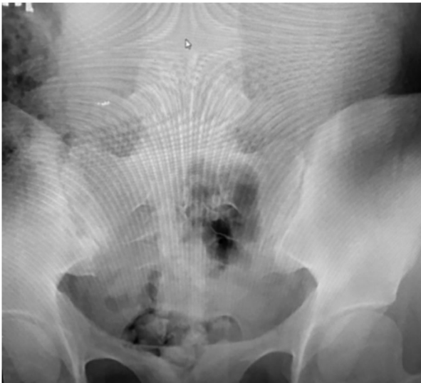
FIGURE 1 Early sclerosis bilateral SI joints