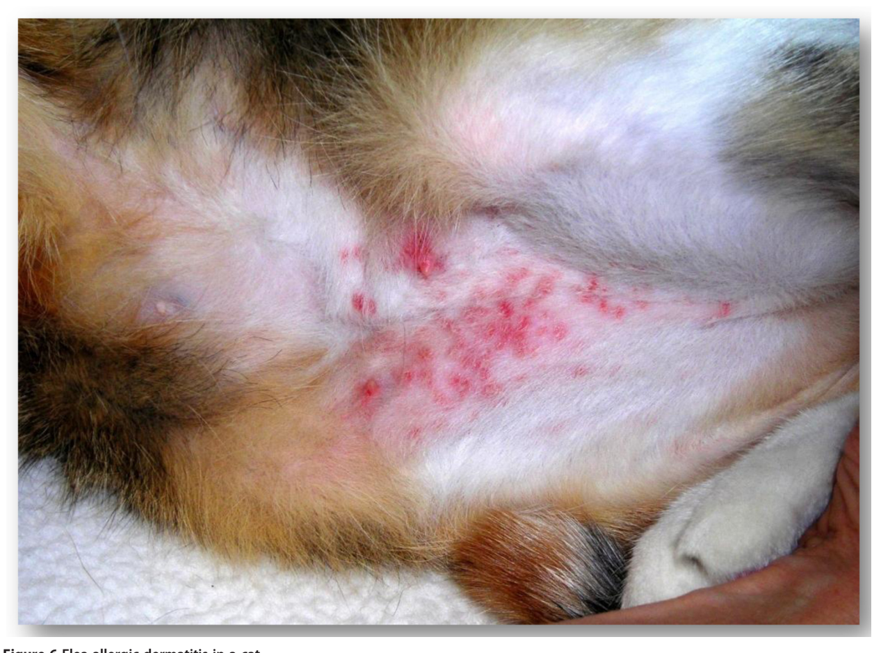
Figure 6 Flea allergic dermatitis in a cat.