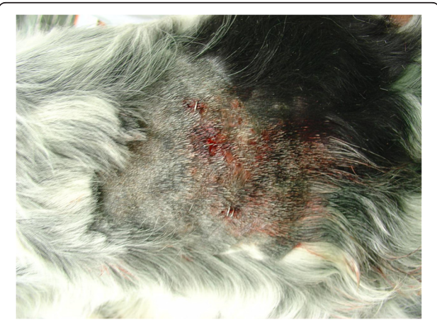
Figure 5 Alopecia and self-trauma induced by biting and scratching in a dog with flea allergic dermatitis.

Ctenocephalides felis can be naturally and experimentally infected with Rickettsia typhi , the causative agent of the "murine typhus", a zoonotic disease which circulates in rodents via the oriental rat flea [29]. Pulex irritans has also been experimentally proved to be a vector of