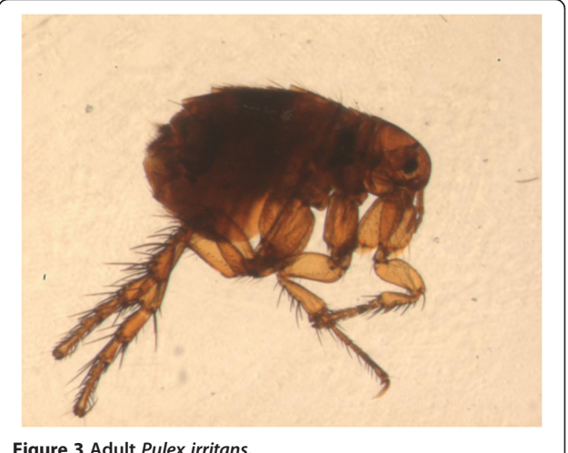
Figure 3 Adult Pulex irritans.

forms around each bite, with a sudden peak in few minutes and, most often, the onset of itching. The lesion may become a hard papillar lesion [10]. Repeated exposure to flea bites induces, in susceptible dogs and cats, a condition called flea allergy dermatitis (FAD). Dogs with FAD (Figure 4) present with erythema, alopecia, excoriation, papules, crusts, itching often leading to selftraumas (Figure 5), while cats show a miliary dermatitis (Figure 6) with nibbling, alopecia (Figure 7), intense pruritus, licking, scratching, self-traumas [15-18]. Along with other allergic diseases (e.g. food allergy diseases), FAD is a major clinical entity in pets, one of the most important skin conditions of household animals, and one of the most frequent causes for seeking veterinary advice [15,19].