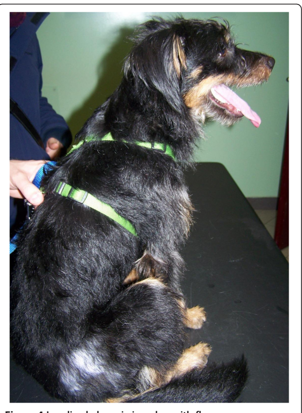
Figure 4 Localized alopecia in a dog with flea allergic dermatitis.

considered a driver for human-to-human transmission of the disease [24,28].