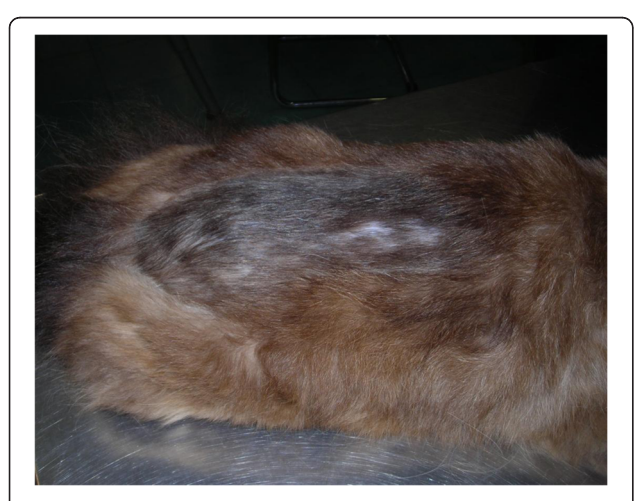
Figure 7 Localized alopecia in a cat with flea allergic dermatitis in a cat.

[2,49,50]. Additionally, the epidemiology of vector-borne parasites is associated with vector phenology and biology, movements of goods and animals, globalization, increase of wildlife in peri-urban and urban areas, and climate changes [2,3,51].