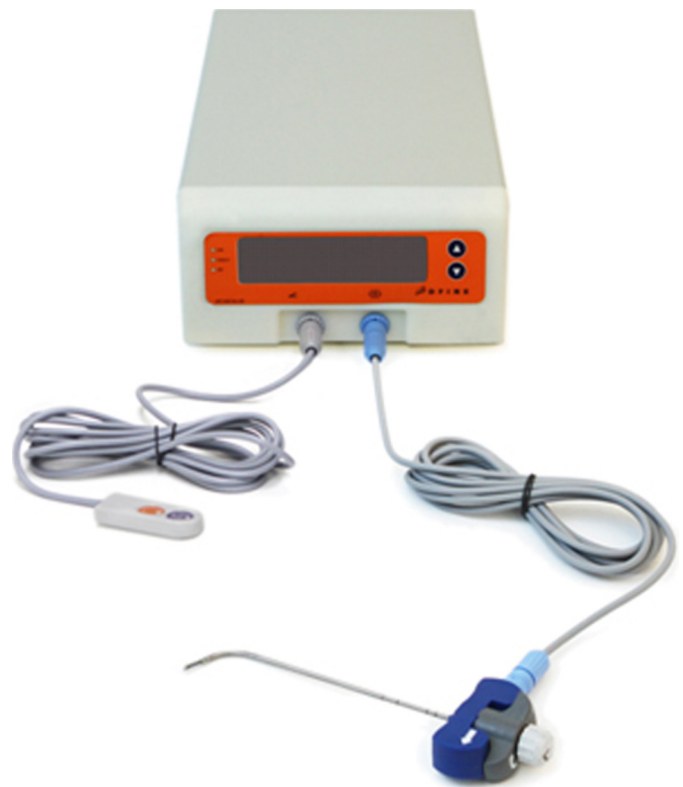
Fig. 1. STAR-system containing the generator and the bipolar navigational ablation instrument.

All animals were examined before and after radiofrequency ablation using CT- (Siemens Somatom, Germany, UHR-spine program) and MRI scans (Siemens Symphony, Germany, hand