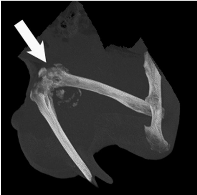
Fig. 2. Sagittal CT reconstruction of the femur of a rabbit. See the tumor with a local destruction in the distal femur marked with an arrow.

the electrode. Fig. 3 demonstrates the changes in MRI imaging before and after the ablation.