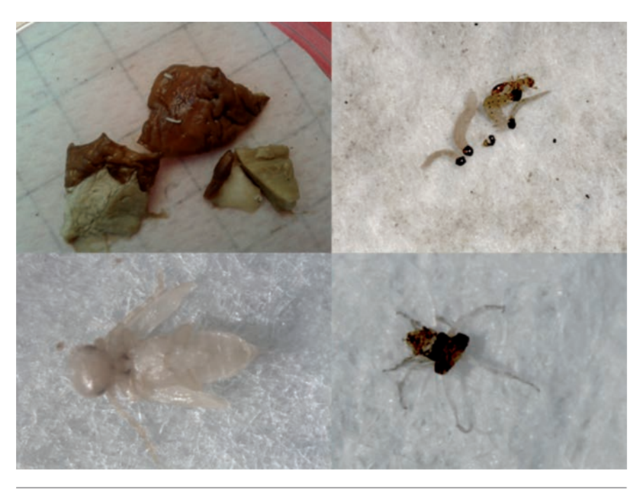
Figure 1. Entomological contaminations observed by filth-test analysis.

observed in the distribution of impurities between the repeated determinations carried out on the same sample (Table 1). This variability is due to the fact this kind of the contaminants do not have a uniform distribution within the sample, thus resulting in the need to transform the data into values that can express a normal distribution; alternatively it may be necessary to increase the number of determinations in order to ensure a significant result. Another possibility is to utilize a prospective analysis applicable to production reality but this is difficult to implement in laboratories where analytical operations are performed routinely.