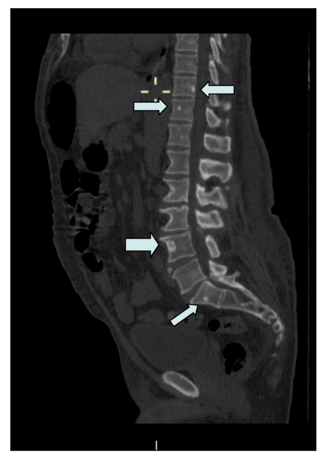
Figure 2. Sagittal view of a contrast-enhanced computerized tomography (CT) scan (with bone window). Note the multiple foci of osteosclerotic lesions throughout the vertebral bodies of dorsolumbar and sacral region (indicated by arrows).