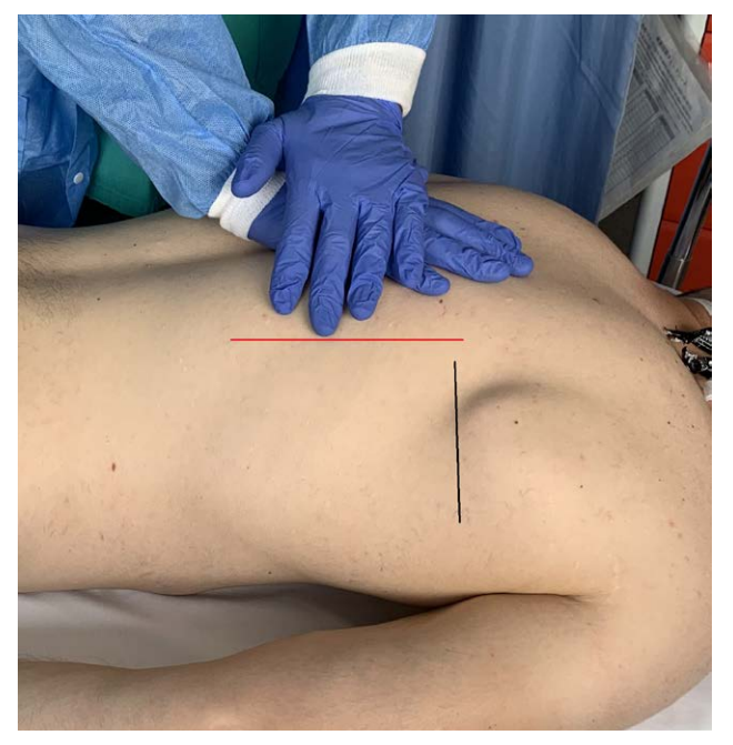
Figure 2. Location where compressions are recommended to be performed in the prone position. Red line represents location of compressions. Black line represents inferior scapular limit.

For prone CPR, landmarks for hand placement used during supine CPR are obviously ineffective. However, a 2017 imaging study determined that