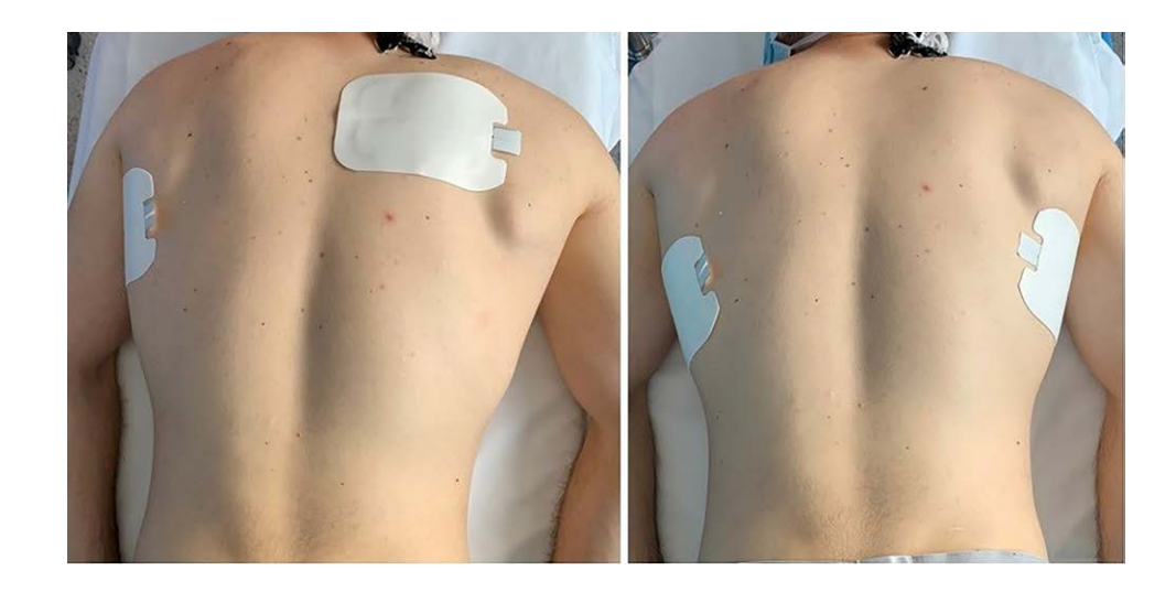
Figure 3. Location where defibrillation pads should be placed in the prone position.

Observational studies and case reports included in this systematic review suggest that basic CPR and