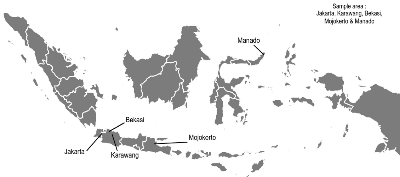
Figure 2 Map of Indonesia and location of research.

We selected four types of respondents through the following sampling methods: