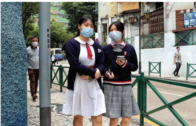
Photo: Macau students return to school. By Macau Photo Agency via Unsplash.

It is clear that there are no easy answers. Whichever approach countries choose to take, it is crucial that there are carefully planned evaluations of the approaches employed to help develop a robust evidence base to guide decision making for this and future pandemics.