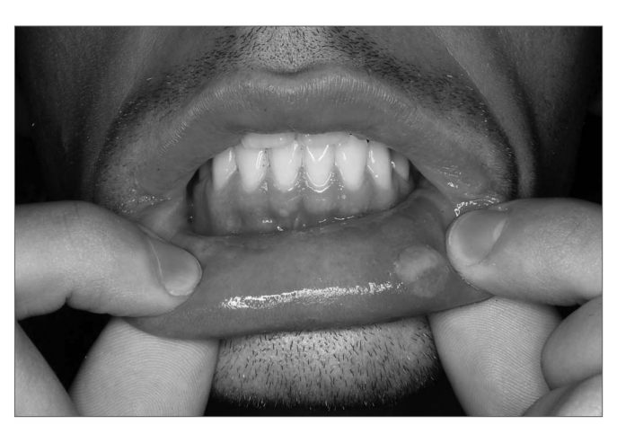
Figure 2. Aphthous lesion in oral mucosa of RAS patient.

Patients evolved to full laryngeal injury remission and partial oral injury remission. They are currently being followed up on a monthly basis, and no adverse developments have been reported to date.