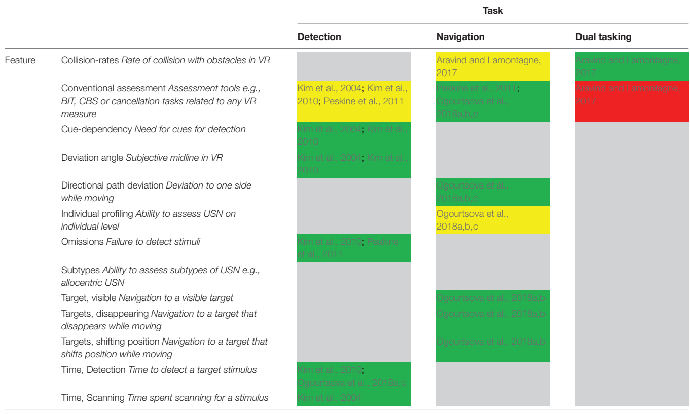
Overview of findings across VR studies. Except "Individual profiling" all findings are on group-level. Colors indicate level of evidence judged by the following criteria: (1) the number of studies able to detect and/or differentiate USN from non-USN or HC, (2) number of studies not able to do so and (3) the magnitude of the calculated Hedges g following Lenhard and Lenhard (2016) benchmarks ( \geq 0.2 = small, \geq 0.5 = medium, and \geq 0.8, large). Green = Good evidence, one or more studies find large effect sizes. Yellow = Medium evidence, one or more studies find large or medium effect sizes but an equal number studies find no differences. Red = Poor evidence, no studies find any differences. Gray = in the present data this feature was not analyzed/measured.

might not be differentiated or even detected. Subtype diagnostics may further improve prognostics on the USN patient's functional independence and advance individual tailoring of treatment. However, information about different USN manifestations might be deduced from the studies. For instance, Ogourtsova et al. (2018b) measured both head orientation and locomotor mediolateral displacements and reported significant group differences in terms of mediolateral displacements, but not head orientation. This could be preliminary evidence for differentiation between different USN subtypes, as it hinted at normal head movement, but abnormal walking paths by USN patients, although no analysis was made on an individual level.