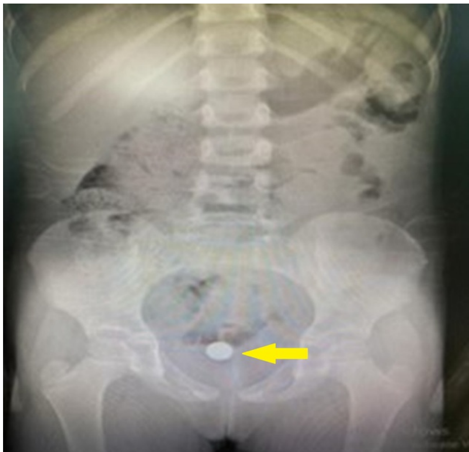
FIGURE 1: Pelvic radiograph showing a radio-opaque object (yellow arrow), most likely representing a disk battery foreign body at the lower part of the pelvic cavity (vagina).

The child underwent vaginoscopy. A 1.2 cm disk battery was removed from the right posterior vaginal fornix without active bleeding. The extracted disk battery had surrounding granulation tissue (Figure 2). The vagina was irrigated with saline several times afterward.