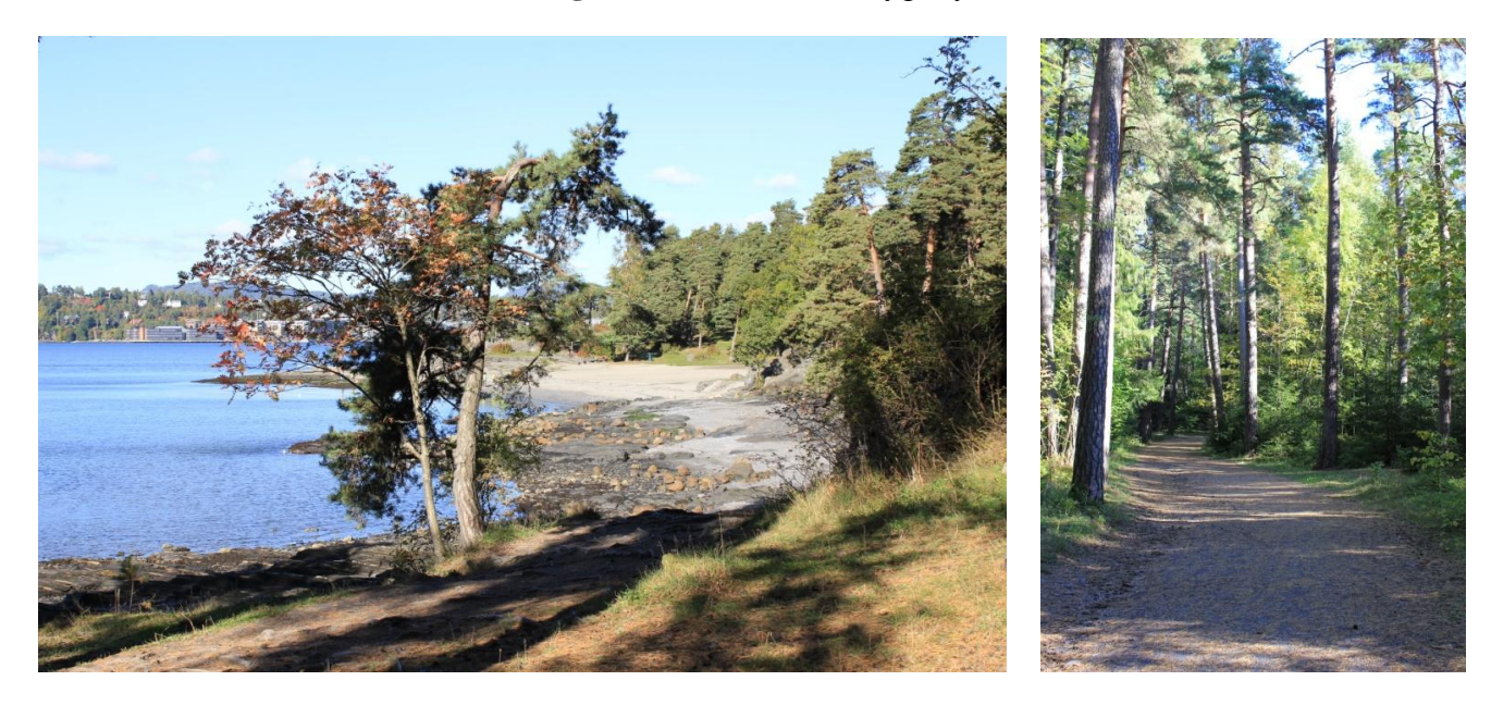
Figure 2. Photos from Romeriks åsen.