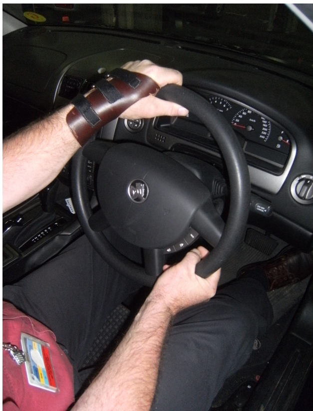
Figure 3 Custom-made leather wrist splint.

scale (VAS) scale where patients report on pain, stiffness and functional difficulty in set activities during the previous 48 hours. The VAS is anchored with 1 = no pain and 10 = extreme pain. The AUSCAN is reliable and valid for use in clinic patients with OA, and has also been demonstrated to have similar levels of reliability and validity when used in a community dwelling population of adults with hand problems [11].