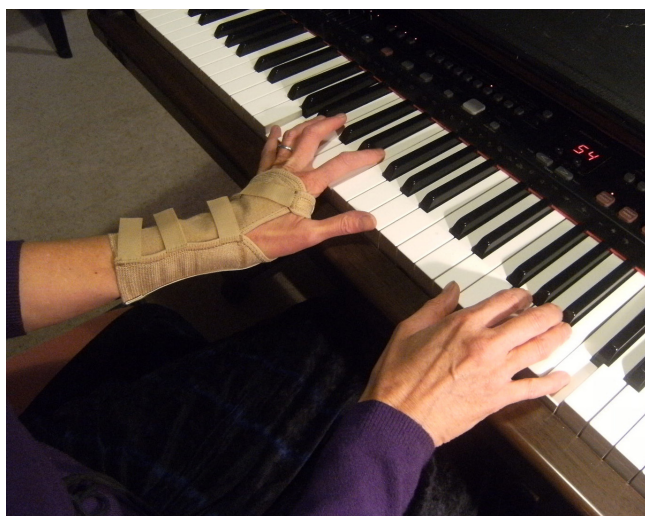
Figure 2 Futuro® wrist splint.

phase. An independent assessor (WR) completed all outcome measures and was blinded to the splint style and sequence. Patients using wrist splints prior to the beginning of the study undertook a two-week washout period prior to their first baseline measurement.