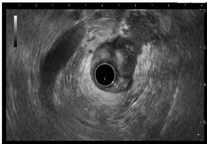
Fig. 1. Fistulous path (no marker was used).

Duodenal fistula (DF) is considered one of the most serious complications in gastrointestinal surgery, which is concerned for its critical status, difficulty in treatment, and high mortality [5]. Therefore, early diagnosis is vital. Jian-an and Ren, Jie-Shou Li, stated that fistulography and abdominal CT scan are important early diagnostic methods [2]. In the management of duodenal fistulae, surgery is the definitive therapy; however, a strong response to conservative measurements has also been described in the literature.