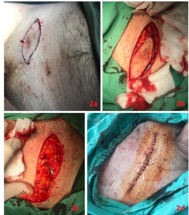
Figure 2: a) Clinical view of acne inversa: erythema nodules in the pubic area; b) and c) Intraoperative view: elliptical excision of the lesion in the pubic area; d) Postoperative finding: surgical defect closed by single interrupted sutures

may be used, which may lead to improvement in milder cases of AI, but they are not curative [1], [3], [4].