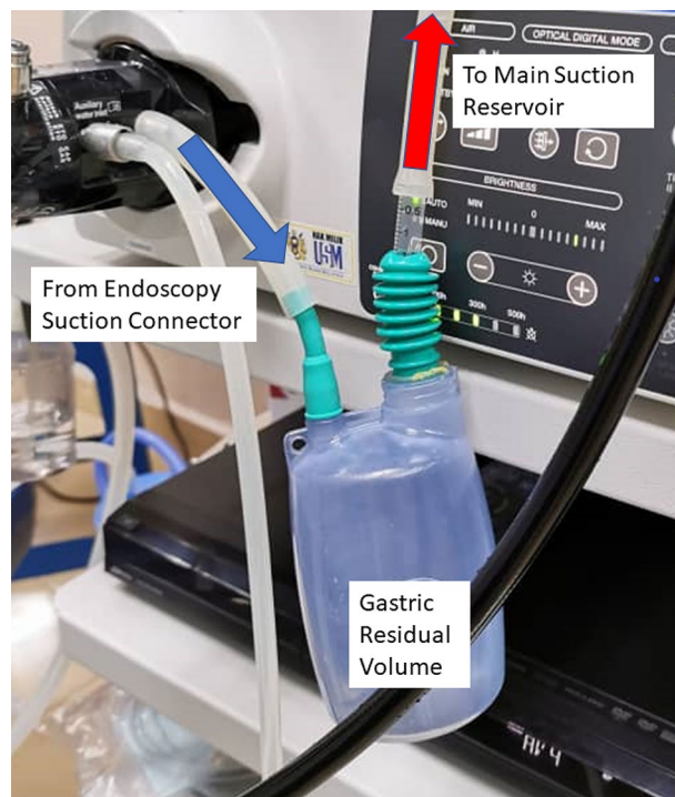
Figure 1. The suction reservoir bottle for GRV measurement.

water on gastric residual volume and the patient's well-being (hunger, thirst, weakness, tiredness, anxiety), and to evaluate for adverse events post-intervention.