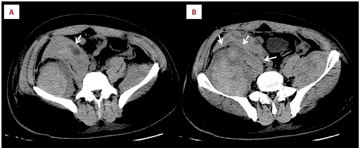
Figure 1. The abdominal computed tomography scan on day 9. White arrows (↓) indicate the hematomas in the bilateral psoas major and iliopsoas (A, B). On the right side, the white arrow indicates (A) the accumulation of blood in the psoas major with the mean value of 19 Hounsfield units, and (B) the fascia between psoas major and iliopsoas with thickening and swelling.

petechiae, hematuria, or bloody stool. The coagulation function test, coagulation factor tests, including factor V, antithrombin 3, proteins C and S, and routine laboratory tests were normal, revealing no indications of a hemorrhagic condition, such as hemophilia.