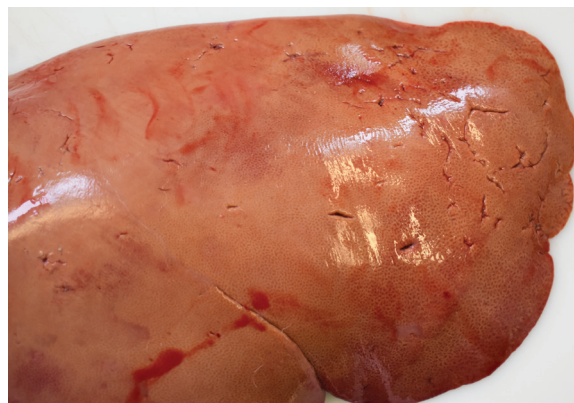
Fig 3. Pale liver most likely due to fatty changes (hepatic lipidosis) in a ewe with pregnancy toxoemia. The indentations are likely due to historical parasitic damage