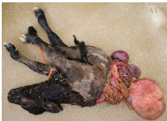
Fig 2: Calf with malformation typical of schistosomus reflexus

20-year study in Australia concluded that it was likely to be a spontaneous defect with no breed association. 1 There are also reports of twins with one affected and one normal calf, as in the case described here.