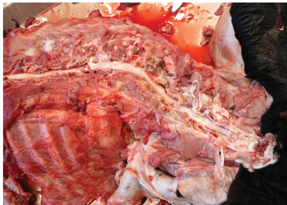
Fig 1: Scoliosis of the lumbar spine of a two-day-old calf

PCR testing on the brain confirmed SBV infection; however, histopathology of the lumbar spine did not identify necrosis and dysplasia of the ventral horn of the spinal cord, which are the characteristic lesions of SBV. Instead, diplomyelia (duplication) of the lumbar spinal cord was present. The cause of diplomyelia is