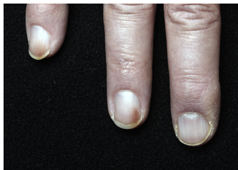
Fig 1. Brown discoloration on the distal medial aspects of the nails on the fourth and fifth digits of twin A's hand.

agents in the United States. It can be found in concentrations up to 2% in over-the-counter products and up to 4% in prescription creams. Higher concentrations are available by compounding pharmacies and over the counter in other countries, but lower concentrations are typically used because of an increased potential for irritation and ochronosis. Although it is the most widely used depigmenting agent in the United States, that is not the case throughout the rest of the world where hydroquinone's safety has come into question. 6 Although the most common side effects are typically self-limited, concerns remain about its potential mutagenicity and carcinogenicity. In vitro and animal models have shown DNA damage with use of hydroquinone. Animal models have also shown increased development of leukemia in some studies. 7 This led some countries in Europe and Asia to ban hydroquinone over concerns about potential malignancy risk. Despite these claims, there are no documented cases of cutaneous or internal malignancy associated with hydroquinone use in humans. 7 Reports of malignancy in animal models involved oral hydroquinone used at very high concentrations, much higher than those used topically. More than 25 cases of ochronosis were reported since hydroquinone's inception over 50 years ago, with none