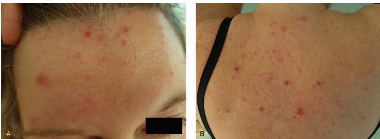
Figure 2. Vesicular skin rash of the face (A) and back (B).

bilirubin 22 \mu\text{mol/L} . Abdominal-pelvic computed tomography (CT) revealed acute pancreatitis associated with two necrotic lesions (Balthazar E score, CT severity index 5) (Fig. 1). There was no biliary lithiasis on ultrasonography. There was no hypercalcemia. The patient reported consuming two units of alcohol per day. A pancreatitis of alcoholic origin was initially considered.